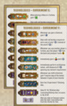
2 EXPERIMENT PLAYER AIDS