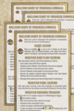
4 COURT PLAYER AIDS