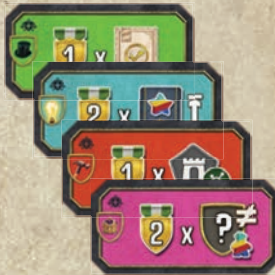
4 PARTY AGENDA TILES (DOUBLE-SIDED)