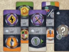
5 STARTING ACTION TILES FOR EXPERIMENT E