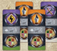
4 ALTERNATIVE STARTING ACTION TILES (ONE EACH FOR EXPERIMENT A-D)