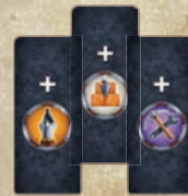
3 EXPERIMENT F CHAINING TILES