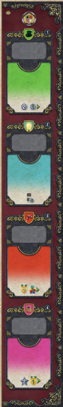
1 COURT SIDE BOARD

NOTE: Experiment F is playable with the base game without the rest of this expansion. In this case: 1) leave the Experiment F Alternative Starting Action tile depicting the Court action in the box, and 2) use the one marked with "*" instead. No additional special setup is required. The rest of these rules assume you are using the complete expansion. Experiment E can only be played with this expansion. The new Experiments are also compatible with Nucleum: Australia.