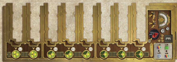
2 NEW EXPERIMENT BOARDS (E AND F)