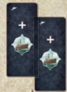
2 SPECIAL SHIPPING TILES (TO USE WITH THE NUCLEUM: AUSTRALIA EXPANSION)