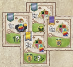
4 NEW CONTRACT TILES