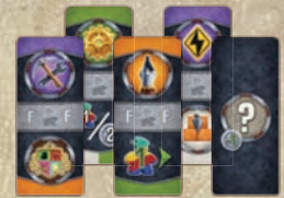
5 STARTING ACTION TILES FOR EXPERIMENT F