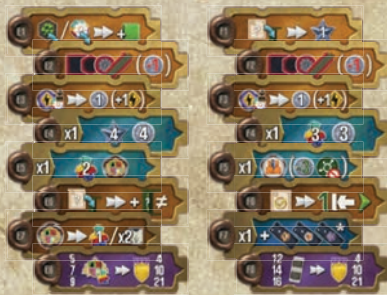
16 NEW TECHNOLOGY TILES