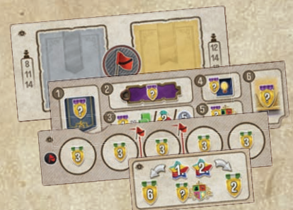
4 SIDE BOARD OVERLAYS