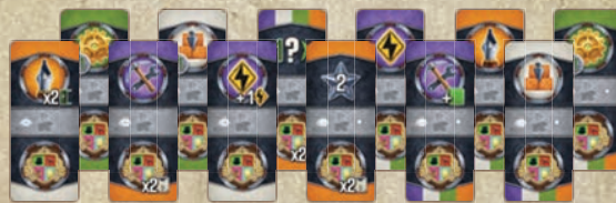
12 NEW ACTION TILES